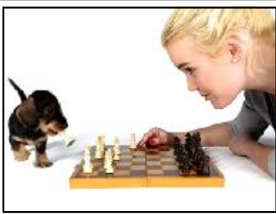
It's Check Mate to the Puppy in 4 Moves.