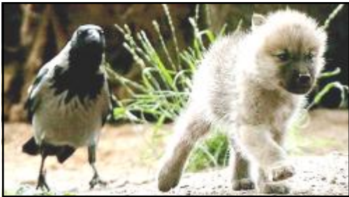
Great Dog-Bird, Useless Bird-Dog.