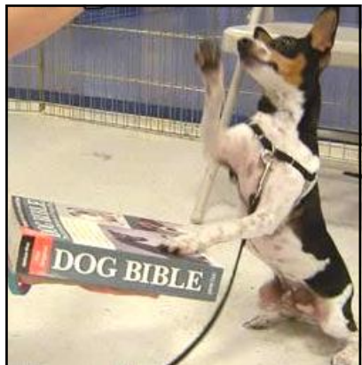
I Do Solemnly Swear that I Didn't Do It.