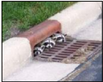
GREAT Grate Raccoons.