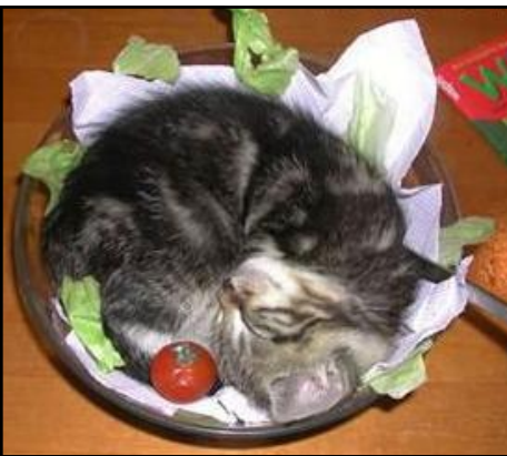
A Side Salad of Kitten.