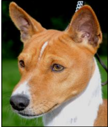
DCC, BOS & RBIS was Baldwin's Robelroy Real Smart