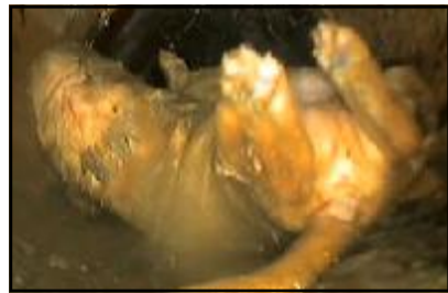
"Dyno" being gently pushed along pipe.